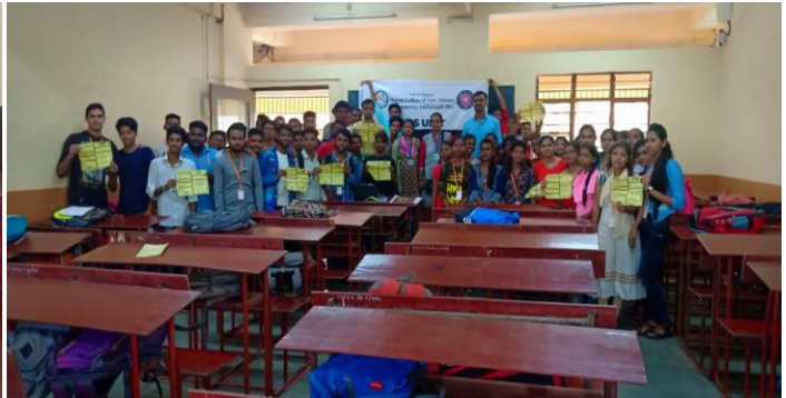
9) 15/08/2019: 100 Volunteers participated in Independence Day celebration.