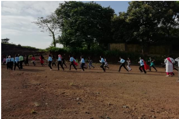
10) 13/08/2019: 80 Volunteers participated in Fit India Movement.