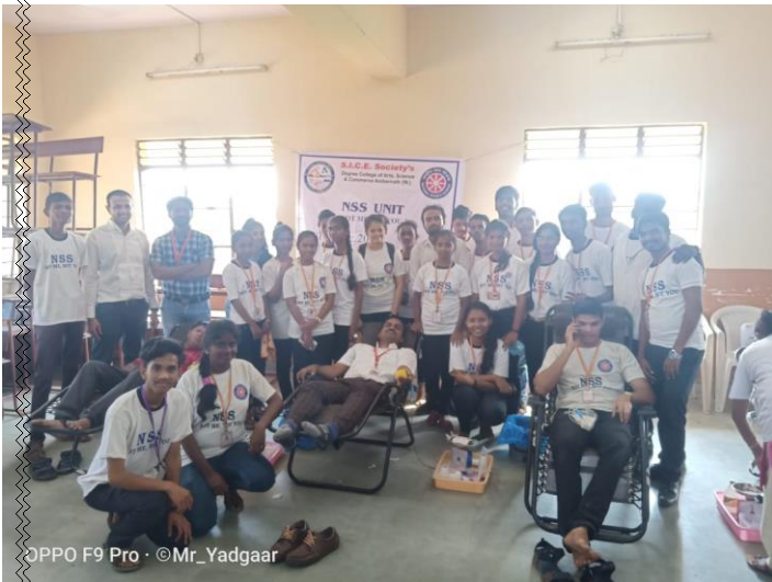
39) 10/12/2019: Blood donation camp held 100 volunteers participated and 84 blood bags collected.