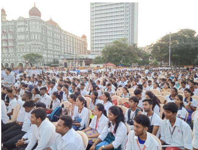
29) 01/10/2019: 100 Volunteers participated in PLOG RUN.