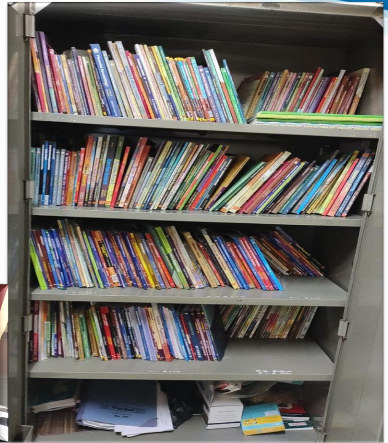
Department Books Stacks