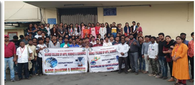
2018-19 at Katraj Dairy Pune