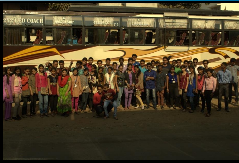
2014-2015 at Silvasa